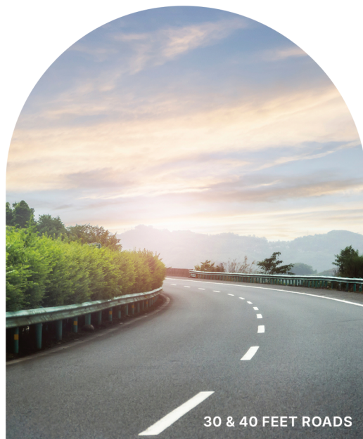
30 & 40 FEET ROADS