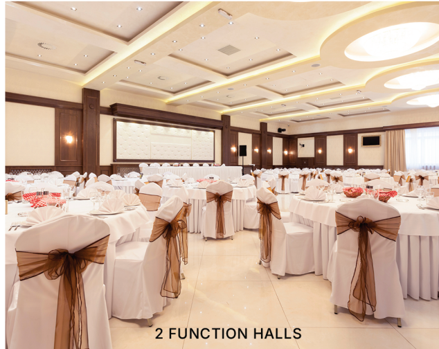
2 FUNCTION HALLS