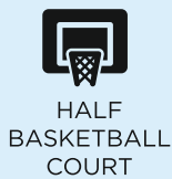
HALF BASKETBALL COURT