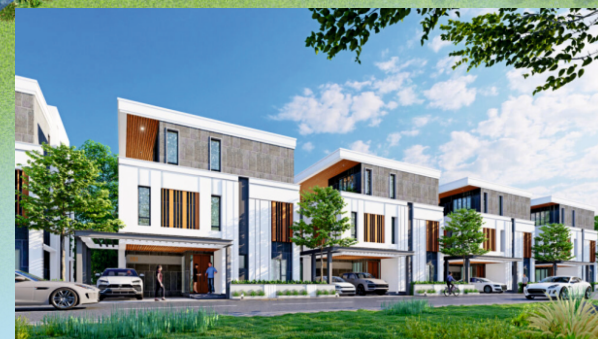
VILLA'S & RESORTS