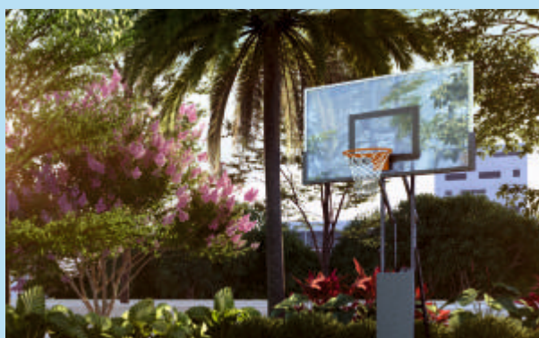
HALF BASKETBALL POST