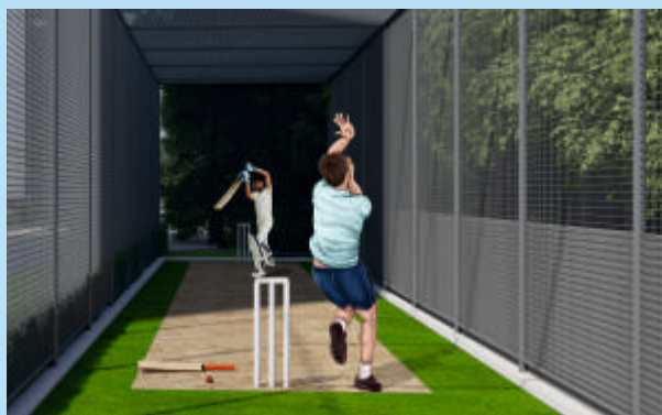
PROVISION FOR CRICKET PRACTICE NET