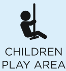
CHILDREN PLAY AREA