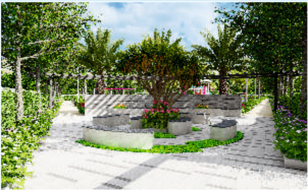
SENIOR SEATING AREA